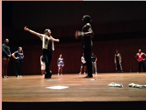
Participants of YTF's Youth Artivism Symposium

For FY15's special event, the YTF designed and facilitated the Youth Artivism Symposium (YAS). This was a first-of-its-kind event bringing young and socially engaged artists of diverse mediums and backgrounds together to share practices and celebrate artmaking for social justice.